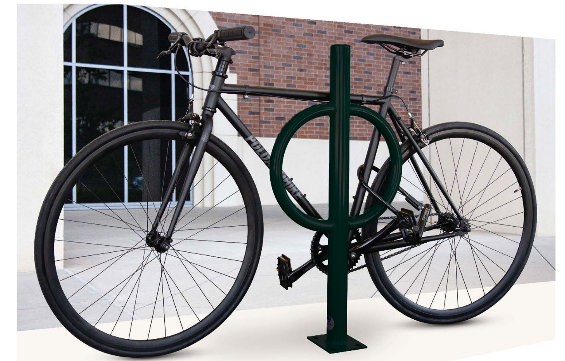
BICYCLE PARKING POST