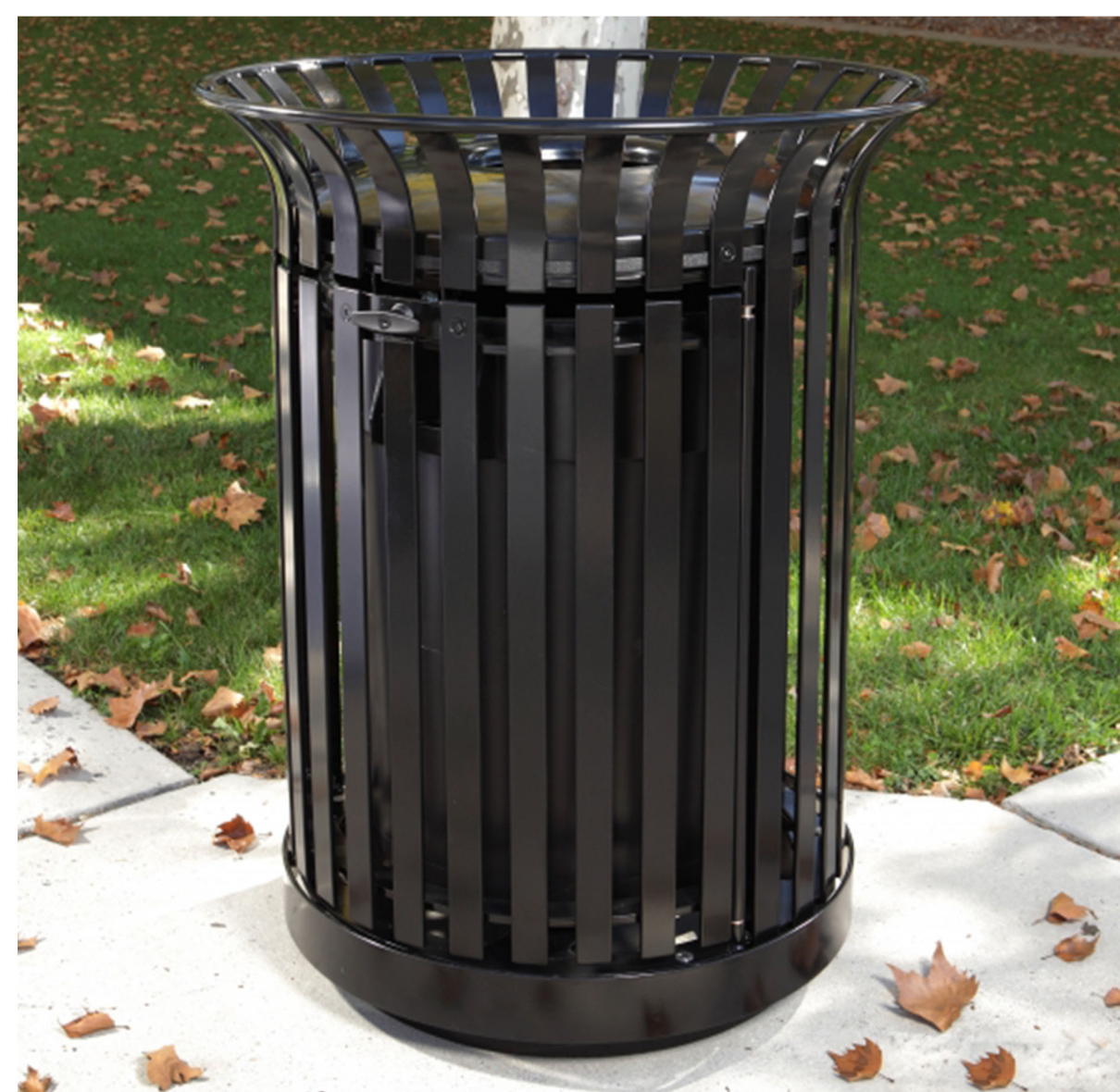
TRASH RECEPTACLE - TYPE A