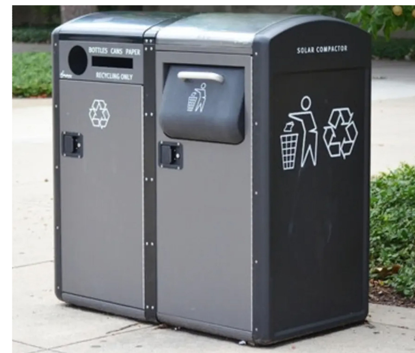
TRASH RECEPTACLE - TYPE B