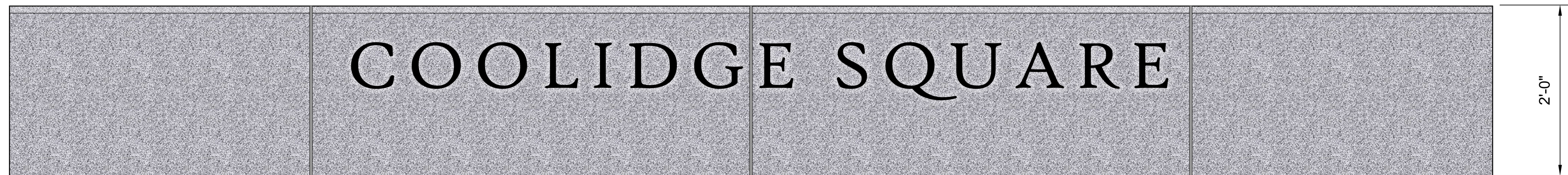
ENGRAVED GRANITE WALL